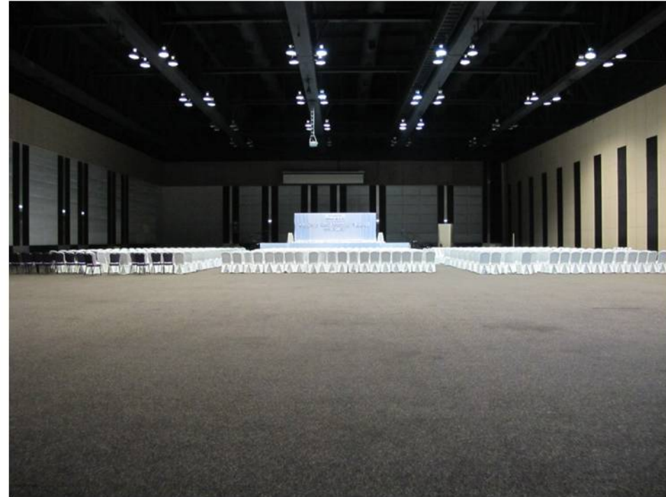
This is 50% of the convention hall. We will use 50% for the opening keynote and one of the conferences and 50% for the exhibition. (Refer to the floorplan layout)