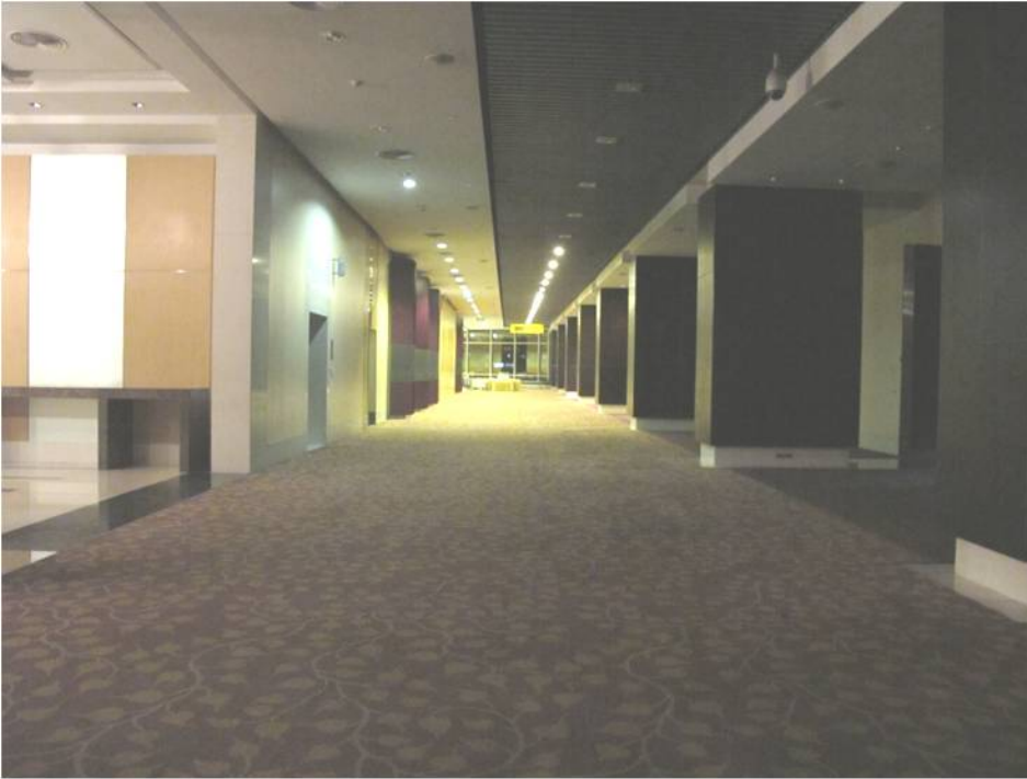
Foyer of the Summit Opening Keynote and Exhibition hall from the registration counters